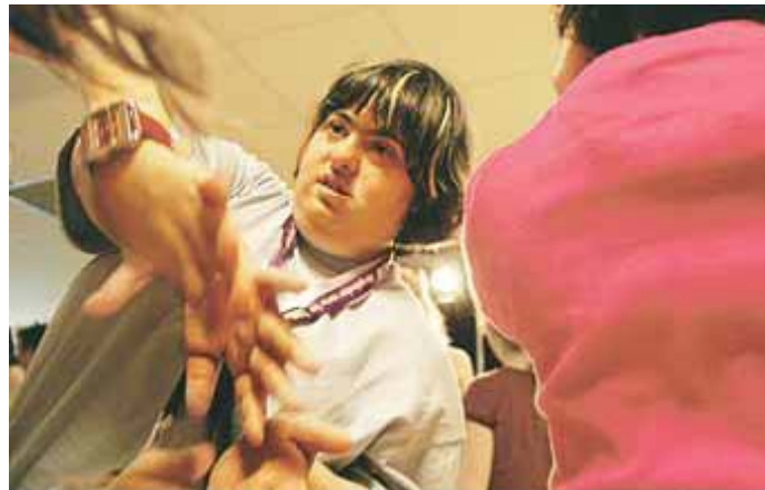
Young artist from Idad.

In this connection the Seminar aimed to underline the necessity for radical improvement in access opportunities for people with learning and/or physical disabilities – particularly the young - to the arts worlds at all levels. The seminar aimed to look with particular regard at active participation in the arts, whether this be in the sphere of the professional arts, the non-professional arts or education.